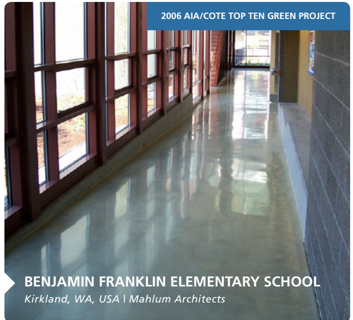
BENJAMIN FRANKLIN ELEMENTARY SCHOOL Kirkland, WA, USA | Mahlum Architects